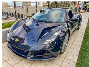
Lotus Emira Arrives at the FTLC